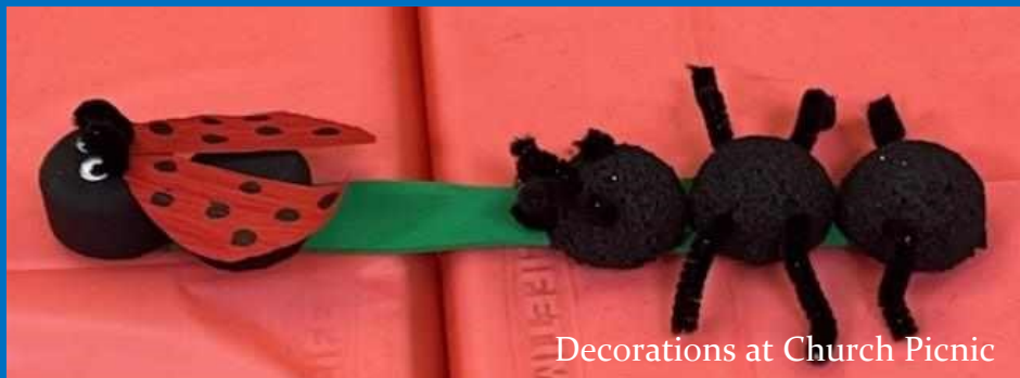
Decorations at Church Picnic